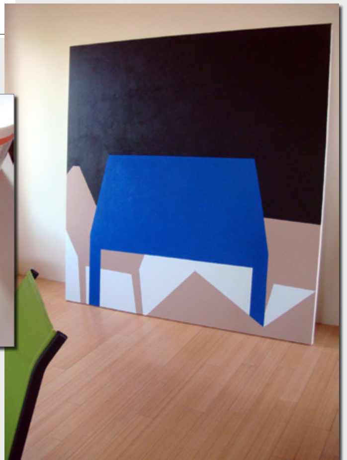
In the studio: "Scene 29"