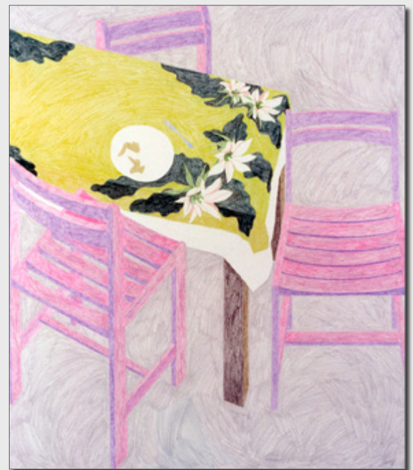
"Wings" Prismacolor on paper 1988 60 x 53"